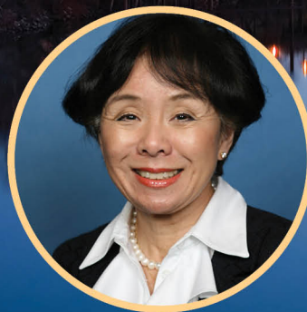
ULI Joseph E. Coomes Lifetime Achievement Honor: Congresswoman Doris Matsui